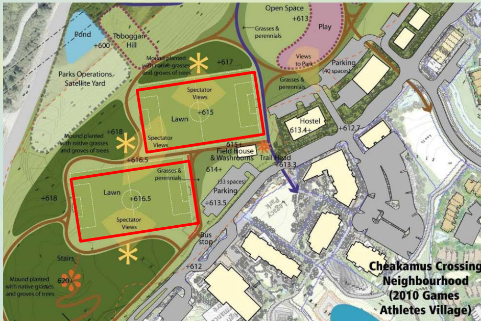
2008 Park Master Plan