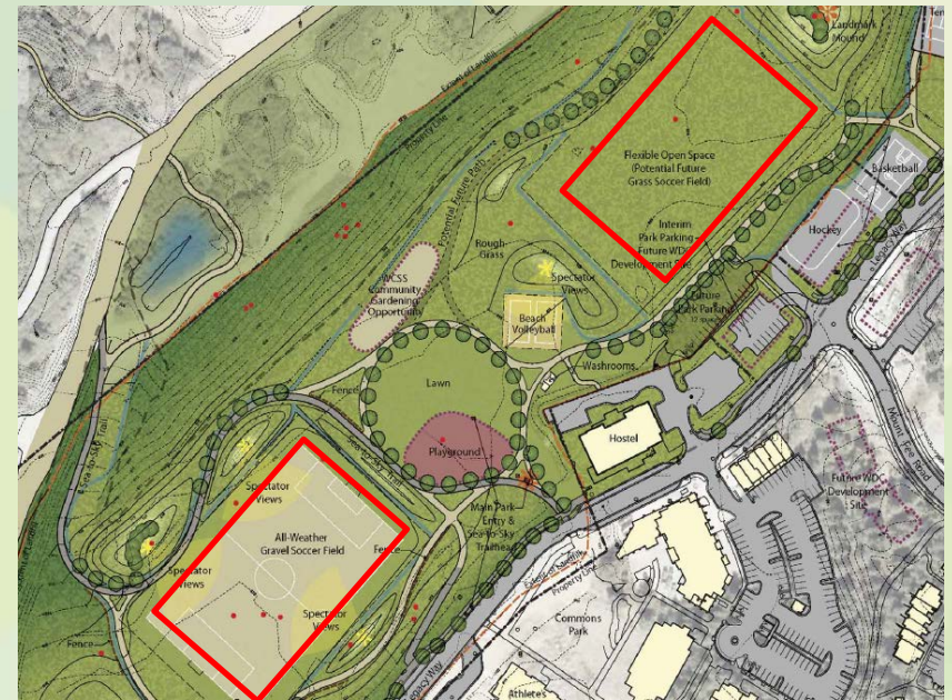
2012 Park Development Plan