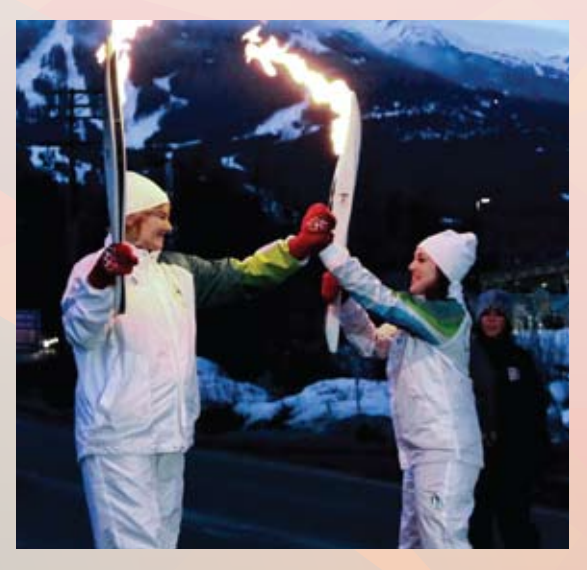
Torchbearers exchange the flame in Whistler

Through the dark Canadian winter of 2009 and 2010, Canadian's saw the flame of the Olympic Torch Relay travel from the most northern point on the route, in Alert, Nunavut, to welcoming the sunrise in Cape Spear, Newfoundland, through to Quebec City, on to Parliament Hill, in streets of Toronto through the Prairies, to the party in Calgary, and ultimately back to British Columbia and all the way home to Vancouver's BC Place. It was a truly Canadian experience.