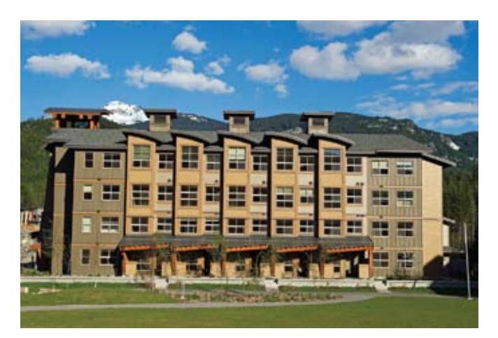
Whistler Athletes Village to become new neighbourhood, Cheakamus Crossing.

Whistler has also benefitted from BC Transit's demonstration project showcasing hydrogen and fuel cell technology development funded by the Government of Canada and Province of British Columbia. This initiative includes 20 zero emission buses, making this the world's