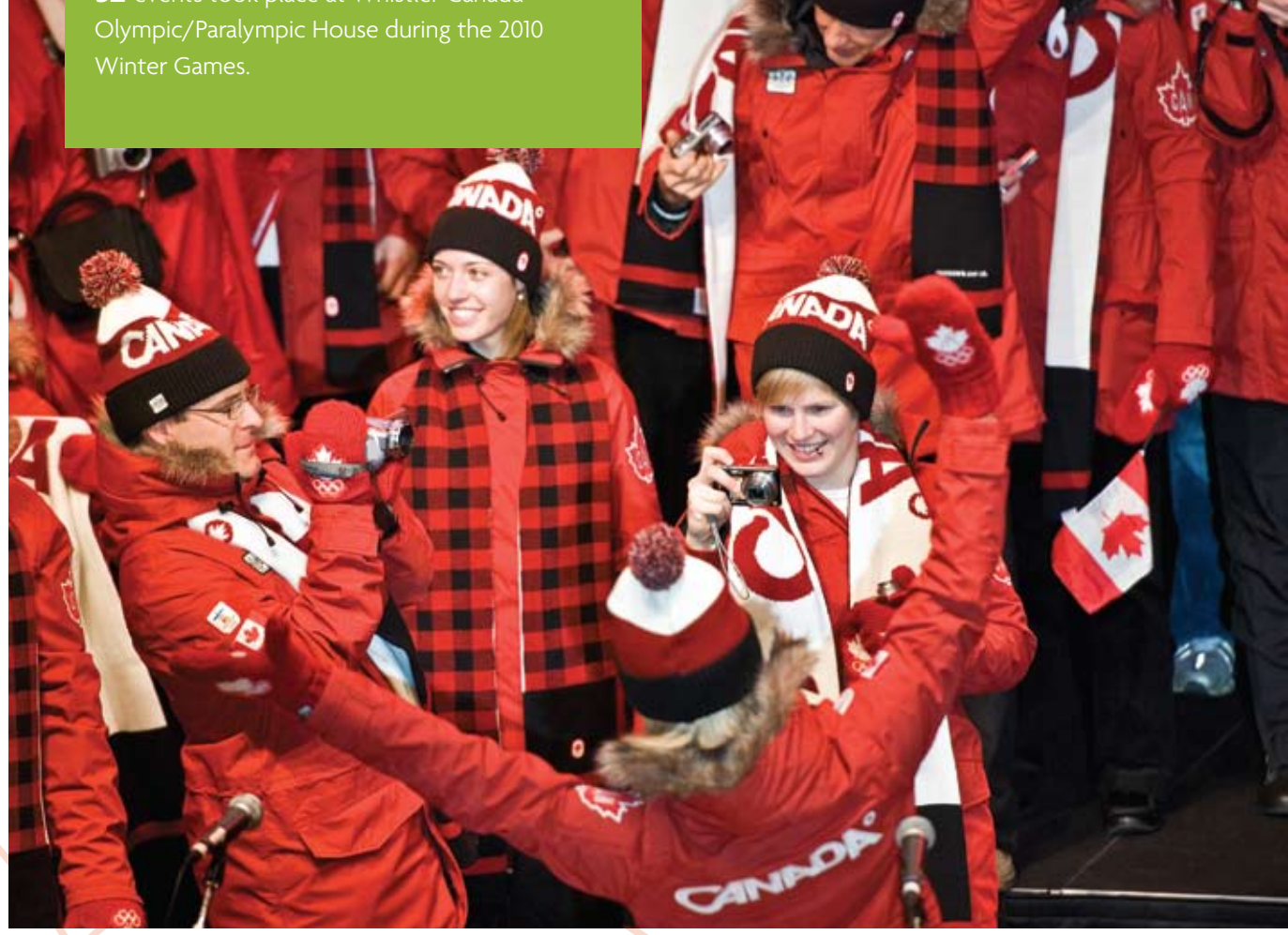
February 12 – athletes parade in Whistler Village

— Lauren Woolstencroft, five-time Canadian Gold Medallist (Paralympic Alpine)