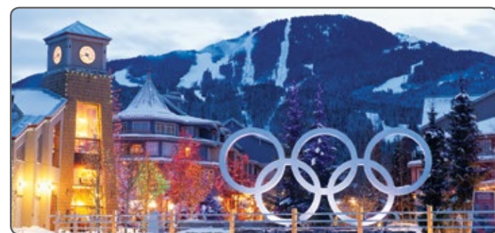
WHISTLER OLYMPIC PLAZA