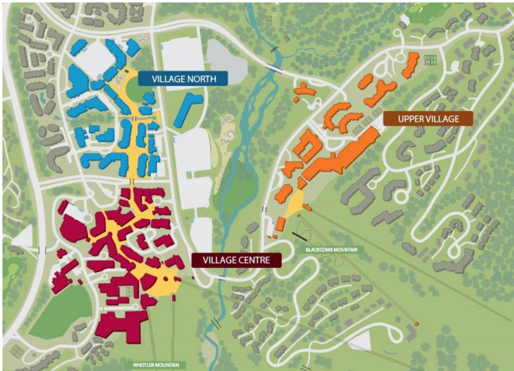
Figure 1. Site Location – Village Stroll